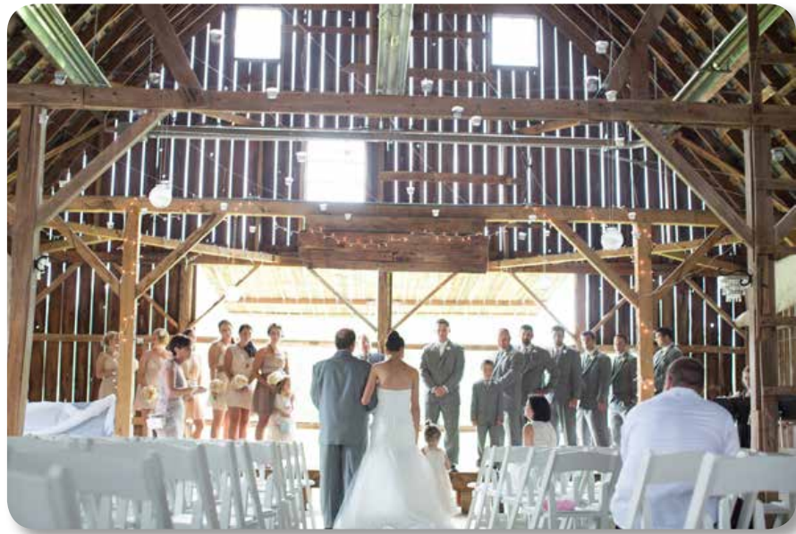
The Enchanted Barn helps create a perfect day for wedding couples.

The Enchanted Barn will be Barron Electric's featured business at the 78th Annual Meeting on Saturday, March 29. Stop and visit their exhibit during registration from 8:30 – 10 a.m. The Enchanted Barn is located at 1543 6 ½ Avenue, Hillsdale. For more information, visit them on the web at theenchantedbarn.com .