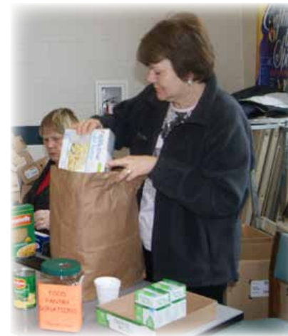
Bring a donation for the Barron Food Pantry and receive a free compact fluorescent light bulb.