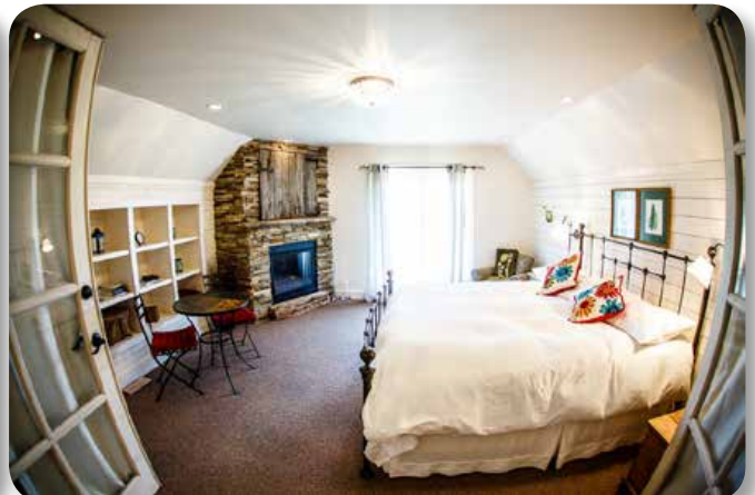
After an evening of dinner and dancing with family and friends, escape to the Loft, the suite nest.