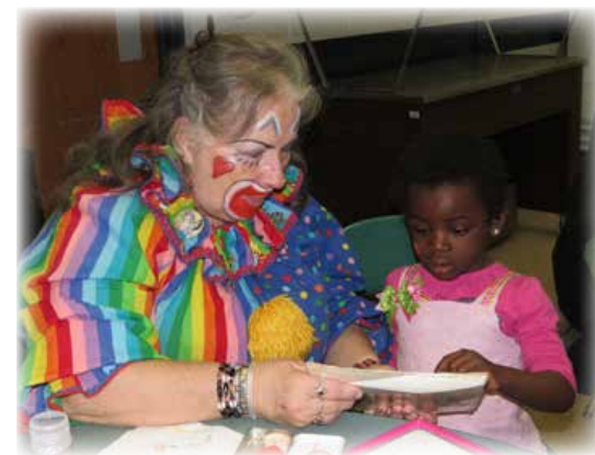
Bring the kids to the Kids’ Carnival. There will be games, face painting, and lunch. The prize drawing will be a 16 GB iPod Touch.