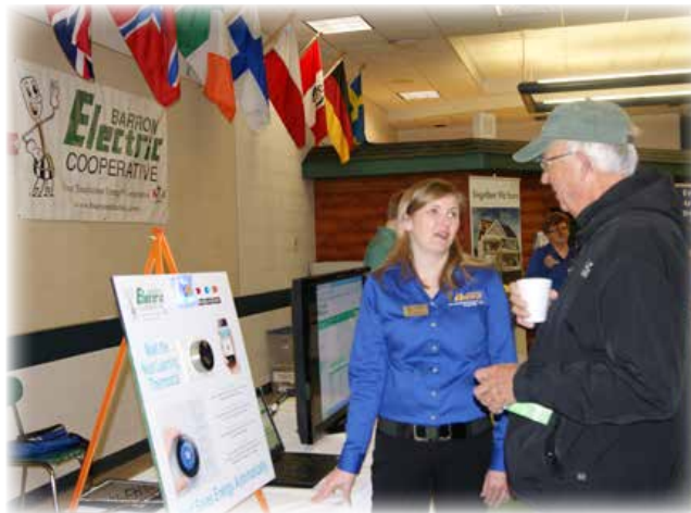
Visit with Barron Electric Cooperative representatives and learn more about the programs and services they offer.